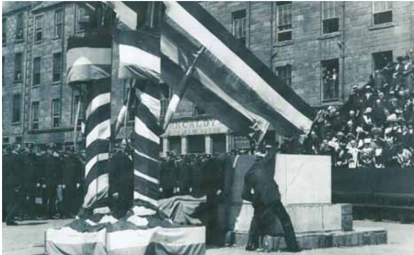
● Laying of the foundation stones